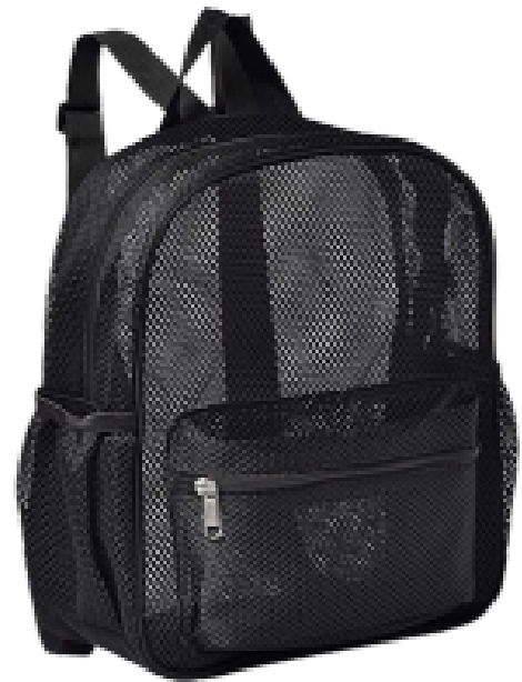
Example of permitted mesh backpack