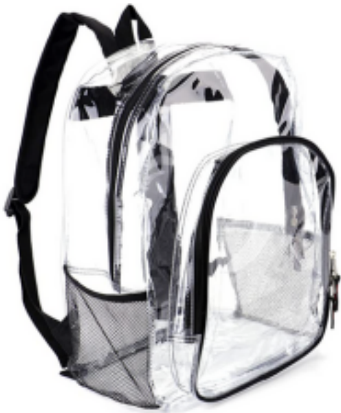
Example of permitted clear backpack

In an effort to improve the safety measures currently in place, MISD requires all middle and high school scholars to use clear or mesh backpacks. Scholars participating in an extracurricular activity are permitted to carry non-transparent bags to store items pertaining to their particular activity (i.e. band, athletics, etc.). Upon entry into the school, all extracurricular activity bags must be stored in lockers or designated areas. All bags are subject to search. Additionally, the maximum size for non-transparent bags that middle and high school scholars will be permitted to carry during the school day, such as lunch boxes/kits, pencil bags, and purses, will be 6" x 9". Elementary school scholars, including 6th graders on elementary school campuses, will be allowed to continue using traditional backpacks.